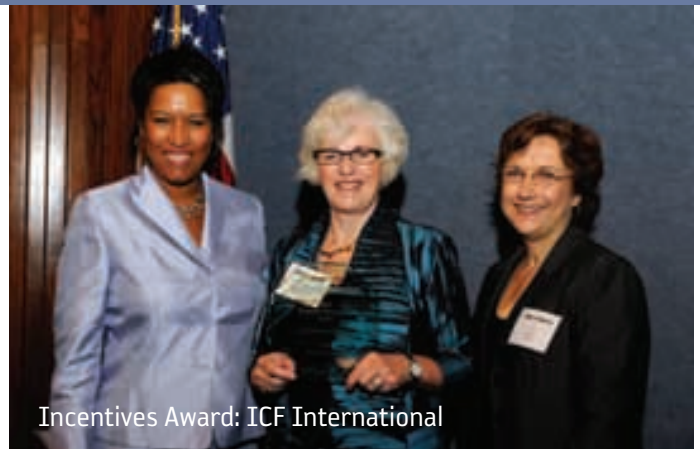
Incentives Award: ICF International

The Organization Achievement award was presented to Bethesda Transportation Solutions for their Walk & Ride Challenge which involved teams of employees who used pedometers to track their steps over a three-week period in September 2009. The purpose was to promote walking and the use of transit to learn how easy it was to get around on foot and/or by using transit instead of driving.