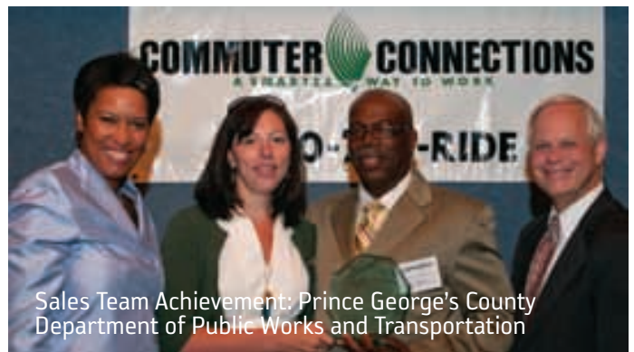
Sales Team Achievement: Prince George's County Department of Public Works and Transportation