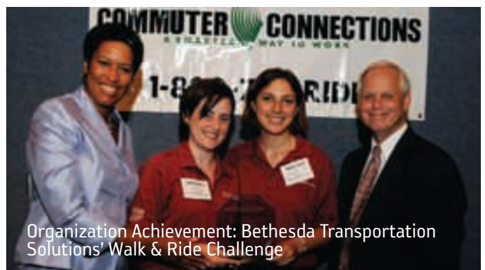
Organization Achievement: Bethesda Transportation Solutions' Walk & Ride Challenge