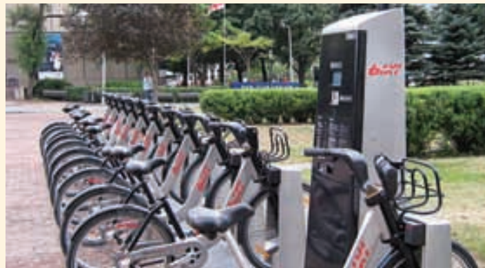
Capital Bikeshare will replicate Montreal's Bixi System

opportunities and more information about Capital Bikeshare, including pricing and locations visit www.capitalbikeshare.com .