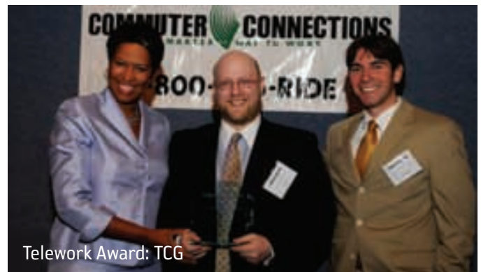
Telework Award: TCG