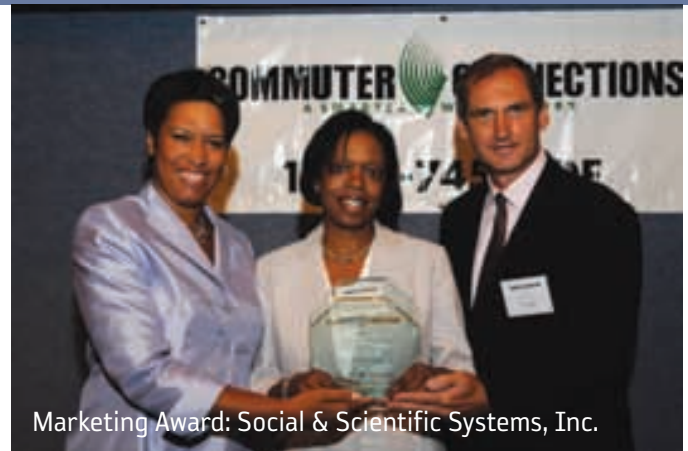
Marketing Award: Social & Scientific Systems, Inc.

The telework policy has significantly reduced TCG's parking requirements, enabling the firm to provide spaces for only two cars in downtown D.C., a major cost reduction. In addition to